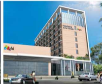
Soho Tower Gurgaon Build up area 3 lakhs sq. ft. (Commercial, ready for possession)