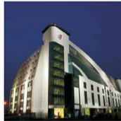
Silverton Towers Gurgaon Build up area 2 lakhs sq. ft. (Commercial, operational)