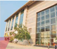
Southern Park Saket Build up area 2 lakhs sq. ft. (Commercial, operational)